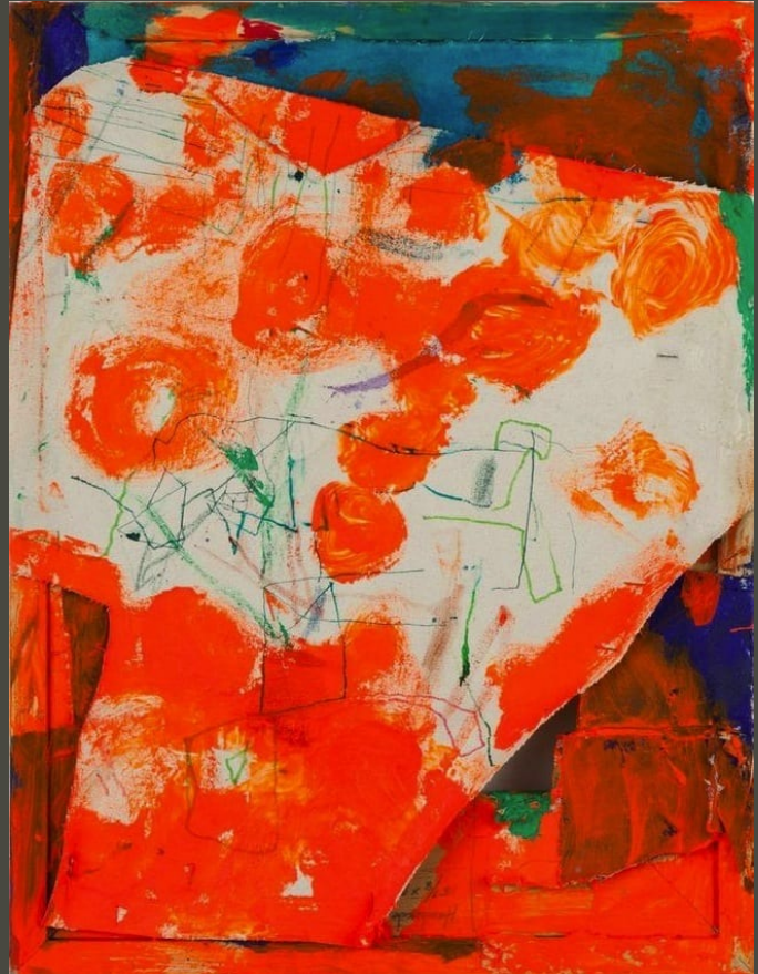
Louisa Waber, Untitled, 2015, Acrylic and ink on canvas, 21" x 16"

Whether a painting is finished or not is often unclear to her – some paintings always want more. Others are more definitive, they practically shout, "done." Sometimes she'll leave a painting alone for weeks or months, and then revisit it once new possibilities reveal themselves. But that is the finished feeling of her works: possibility revealing itself.