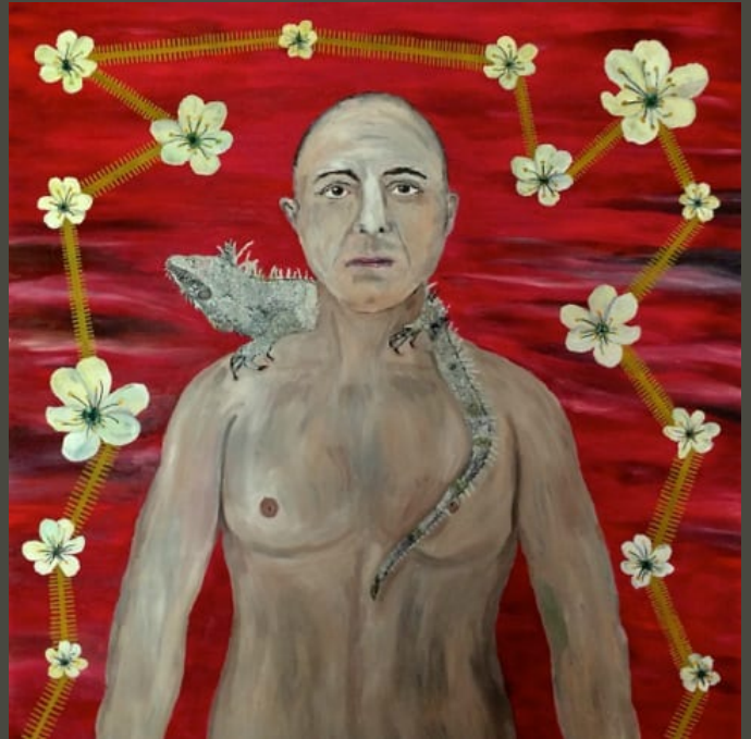
Yaron Rosner, Untitled, 2016, Oil on canvas, 50 x 52"

Yaron Rosner's paintings appear as if from dreams. A series of large-scale, richly painted portraits depict subjects Rosner describes as "living on the side of life." A middle aged shirtless man stands staring at the viewer, an iguana perched on his neck, in a space between fear and confrontation. Rich in symbolism, humor, and contradiction, Rosner's paintings portray both strength and fragility; a young man reveals a wound, a woman holds a drooping bouquet, another man cradles a turtle. Affinity for reptiles aside, there is purpose in Rosner's pairings and dreamlike as they are, one sees oneself in the paintings.